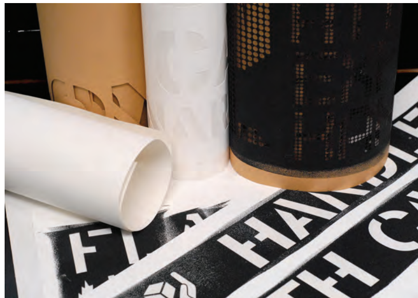
40407 1/4" (6.3 mm.) 63 characters / foot